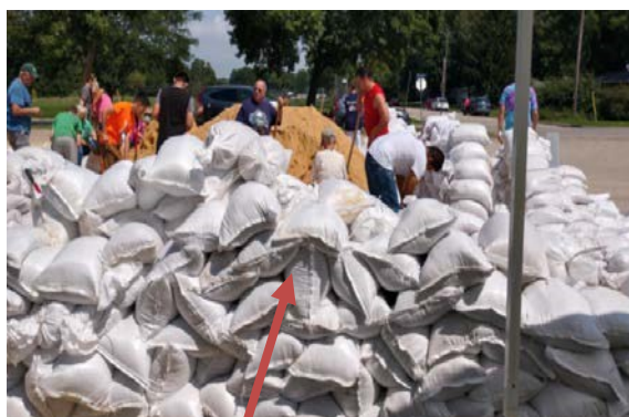
Members of our Hispanic Council doing double duty -