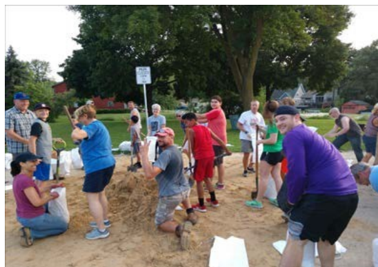
Various other Council members assisting