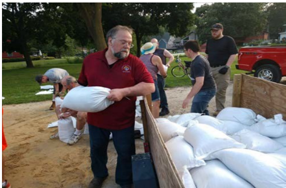
Members of Council 4879 assisting above & below